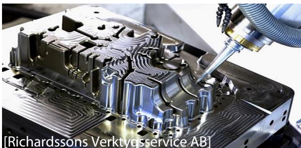
[Richardssons Verkytsservice AB]

Electric and hybrid vehicles need to become lighter to compensate for the additional weight of the battery and to extend the range. Die casting is one of the most productive manufacturing processes for the thin-walled components , such as battery housings, which realize the thermal control of the battery through complex cooling channels. In order to be able to establish the die casting of high-melting alloys industrially, solutions must be developed that meet the high demands on the tool material, such as corrosion resistance, wear resistance and withstand the stresses in the process. One approach is the development of protective tool coatings .